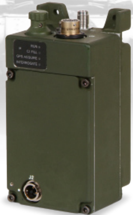
RBCI Responder-01, Approved for Public Release 01-08, EXPID1202